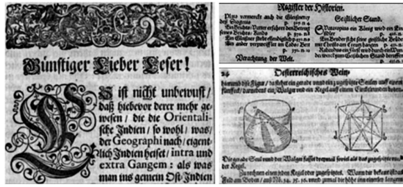
Figure 1: Pages with coexisting typefaces ( Fraktur and Antiqua ), double columns, and images surrounded by texts.

input text at character level , and outputs the corrected text during the decoding phase. Representation at character level is necessary given that OCR transcription errors at the most basic level are at character level. The input is encoded through a combination of RNN and deep ConvNet (LeCun et al., 1995) networks. Our encoder architecture allows us to flexibly encode the erroneous input for post-hoc correction. RNNs capture the global input context , whereas ConvNets construct local sub-word and word compound structures. During decoding the errors are corrected through an RNN decoder, which at each step through an attention mechanism combines the RNN and ConvNet representations and outputs the corrected text.