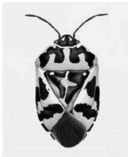
Figure 1. Garden bugs, Kussaberg (Germany), close to Leibstadt nuclear power plant, by C. Hesse-Honegger (Raffles, 2010).

facilitate a more exploratory approach to rendering data interpretable and analyzable (for a discussion, see Waltman & Van Eck, 2016) 4 .