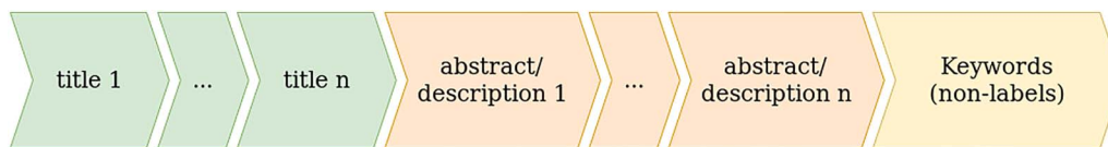
Figure 2. Concatenation of the payload parts.

were filtered out as duplicates. The high number of duplicates can be explained by the occurrence of DOI-versioning 21 , which is the publication of several versions of a research data item under different DOIs and one “concept DOI,” which maintains references to the different versions. As a result, a lot of payloads are identical if the title, description and subject tags do not change over versions.