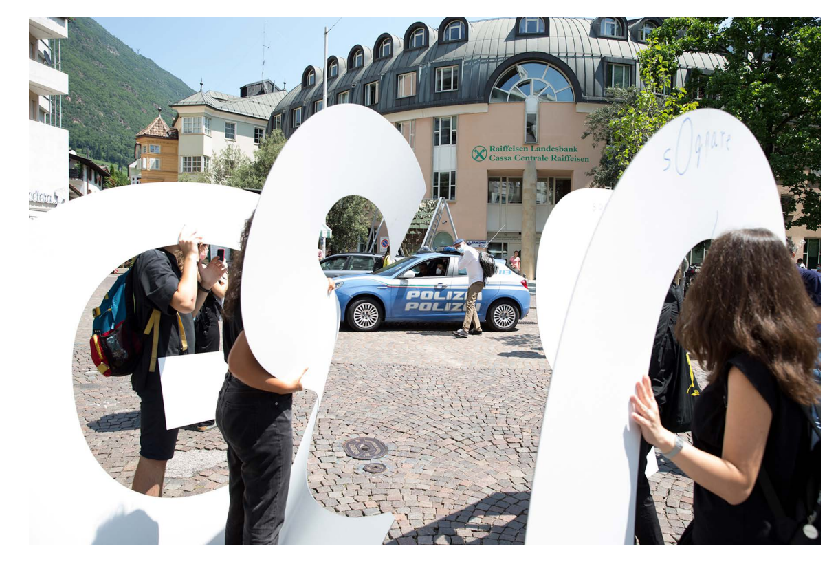
"The Bolzano police object to our dream."