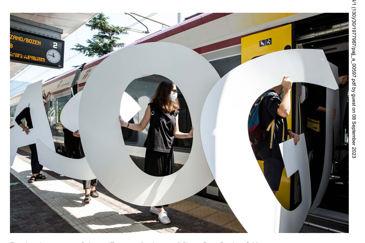
Travel to the twin town, Bolzano. "Trains are for dreaming."

32 ■ PAJ I30 ARIAS-MISSON / Dreaming ■ 33