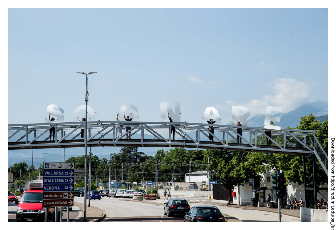
Bridge across the entrance to Rovereto. "The Bridge Dream."