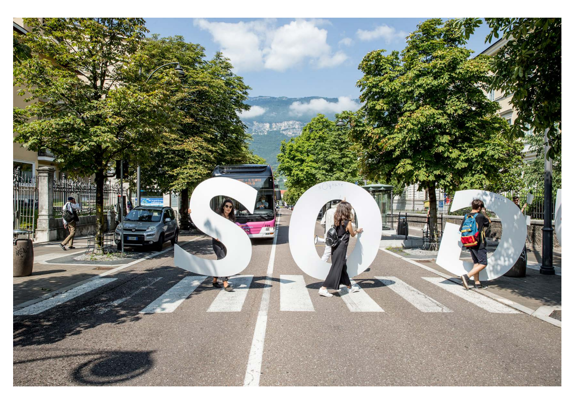
Crossing the street in Rovereto.