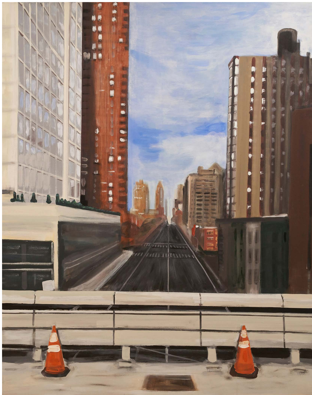
Ninth Avenue looking north. Acrylic on canvas. 60" x 48".