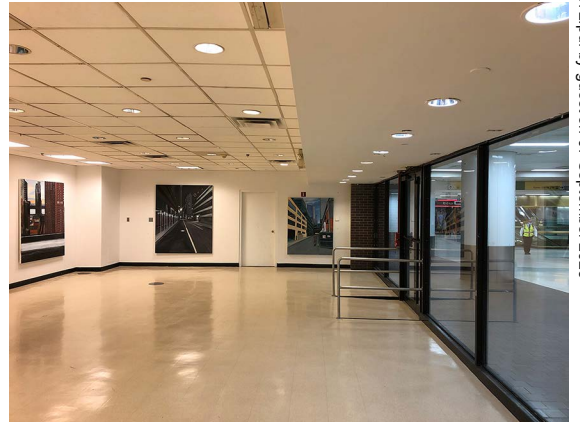
View of passersby in front of gallery.