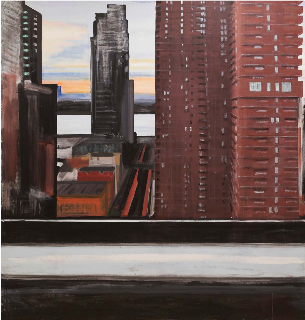
42nd Street looking west. Acrylic on canvas. 66" x 62".