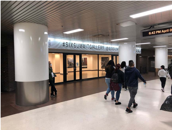
Installation view. Six Summit Gallery, 2nd floor, Port Authority bus terminal, NYC.