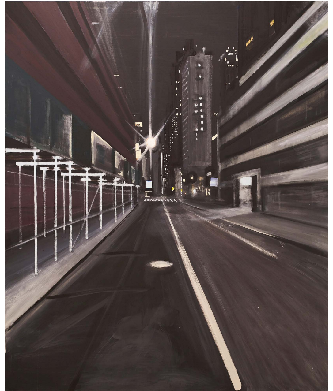
43rd Street looking east. Acrylic on canvas. 72" x 60".