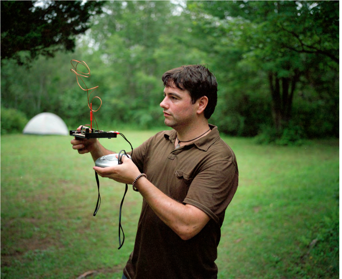
Studies for Radio Transceiver by Matthew Burtner. Performed during the Spectral Garden event at free103point9 Wave Farm, 2006. Studies for Radio Transceiver questions the nature of the radio medium and the role it plays in forming the content of a musical system.