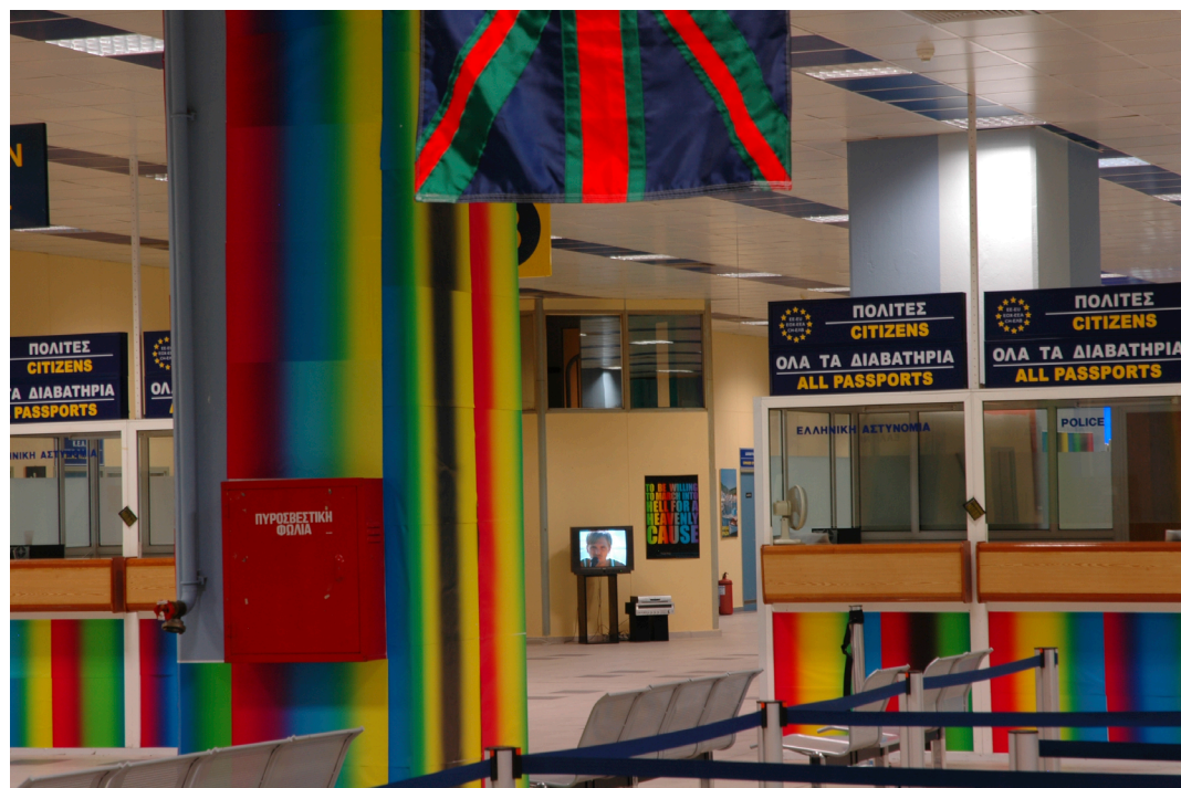
Bottom: Disco Coppertone (2007) an exhibition on tourism curated by Locus Athens at OLP in Piraeus, a transit space for passengers on cruises.