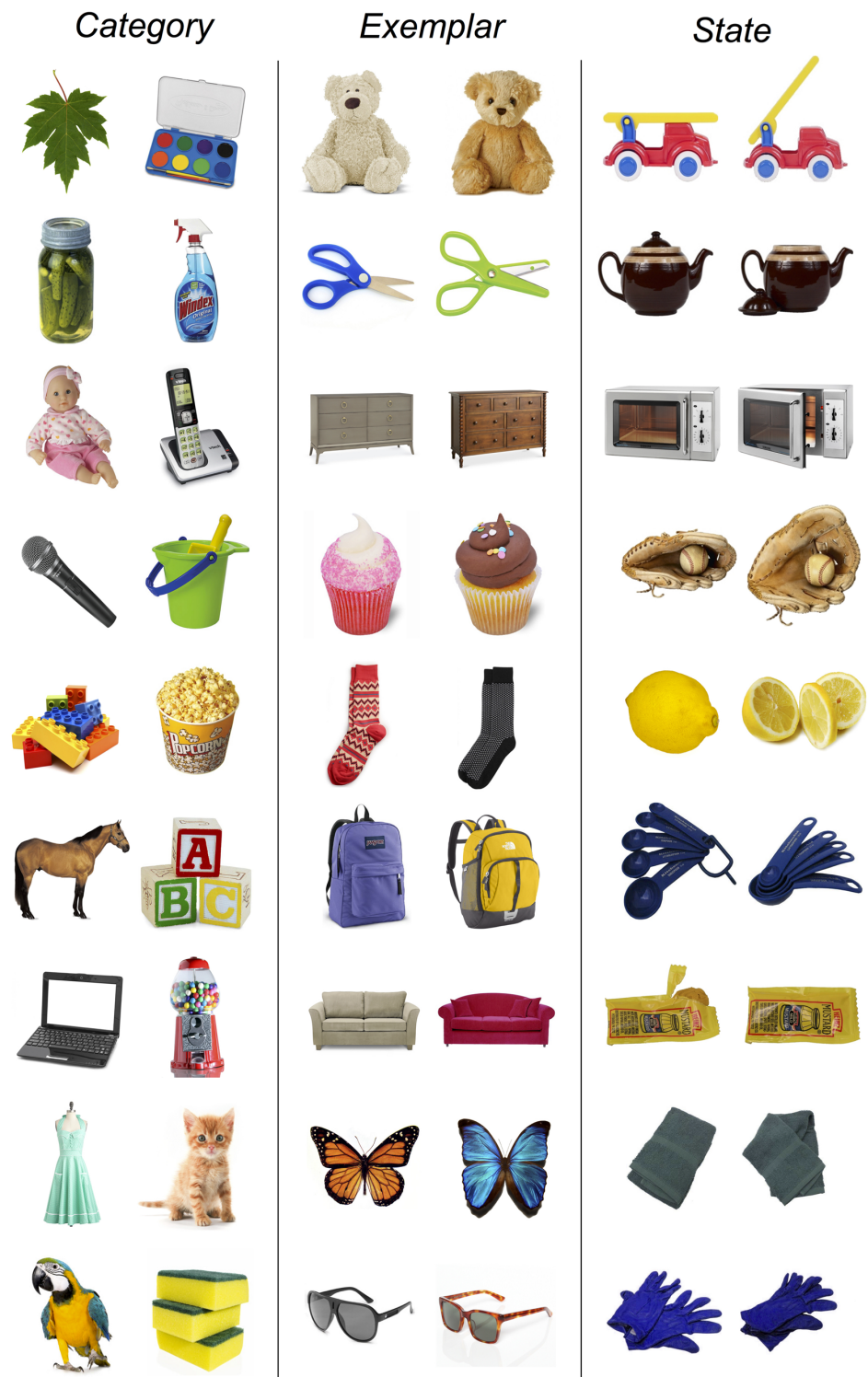
Figure 1. Nine example test pairs presented during the two-alternative forced-choice task for the three conditions (Category, Exemplar, and State). There were 50 test pairs per condition. The complete stimulus set is available at http://parklab.johnshopkins.edu/IMAGE_SETS_2.html .