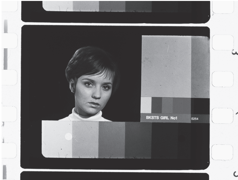
BKSTS Reference Leader Picture. 1970.

With the broad adoption of color in the early 1950s, there arose the demand for still more stringent quality-control measures. While color technology existed prior to the 1950s, the use of color in mainstream film had been monopolized by Technicolor since the late 1910s. 10 In 1949 Kodak introduced Eastmancolor negative color stock, its first three-color, single-strip color negative and printing film stock. 11 This was significant because it meant that any lab, and not just those operated by Technicolor, could develop and print color film. A host of other color stocks made by a number of rival manufacturers soon followed. Laboratories in the '50s once again faced pressure to maintain consistent control over variations, now in color as well as image density and sound. To address these increased demands in quality control, individual labs began producing their own China Girls. By the '60s, film manufacturers were also selling China Girls to accompany each film stock.