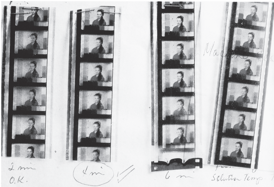
Kodachrome test strips. C. 1935.