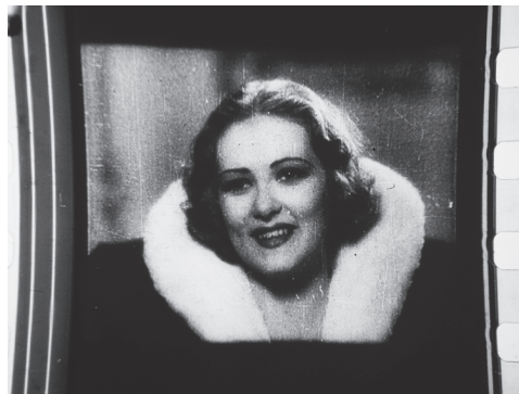
China Girl. C. early 1930s.

An aesthetically pleasing picture was required that would provide both objective and subjective information relating to tone response and colour rendering at the laboratory