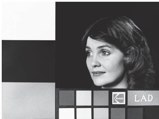
Kodak Laboratory Aim Density (LAD) system image. 1976.

In 1976, John Pytlak introduced the LAD system, which gives a more precise reading of density based on an 18 percent gray patch that forms part of the