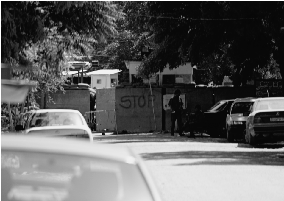
Paglen. Black Site: Kabul, Afghanistan. 2006.

But the overall question of the cultural politics of "viewing" art is something I just haven't spent that much time working out. I have a sense of what works for my own art, but don't really have a meta-theory of it. I'm much more interested in the cultural politics of producing art than the conditions of "consuming" it. I have long understood artworks as congealed social, political, and cultural relations, and that is what I'm interested in exploring. If I have anything to contribute to how we understand cultural production, it probably comes more from a "geographic" perspective than a traditional cultural-studies perspective. In a lot of my works, I try to set up various relations of seeing from which the artwork emerges. If I go out in the desert and spend a week photographing covert military operations, for example, it's quite likely that I'll ultimately end up with something quite formal or