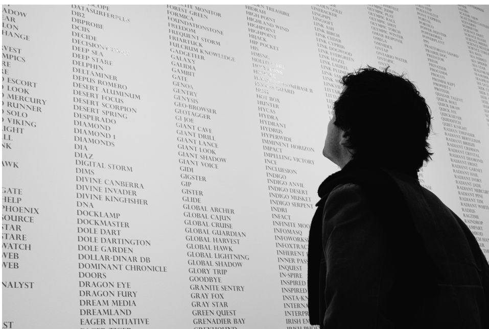
Paglen. Code Names. c. 2001–.

Stallabrass : That's a fascinating answer, and picks up on many of the issues that came to mind as I look at your work. I notice that you write in your Aperture monograph of a dialectical opposition between an image's claim to represent and the undermining of that claim. It's good you specify that further here. 3 It's easy to see that Adorno's concentration on the specificity of the object, and the instrumental and contradictory social forces that bring about its misdescription, has an affinity with your work. Beyond that, I wonder: is there something about the military (and the most secretive aspects of the military) that has a further affinity with negative dialectics? Is this part of the point of your listing of hundreds of code names of secret projects?