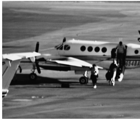
Paglen. Workers Gold Coast Terminal Las Vegas, NV Distance ~ 1 mile. 2007.

I take all of this as a starting point. In terms of my own aesthetic vocabulary, I tend towards images that manifest this dialectic. Images that 1) make a truth claim ("here's X secret satellite moving through X constellation," for example); 2) immediately and obviously contradict that truth claim ("your believing that this white streak against a starry backdrop is actually a secret satellite instead of a scratch on the film negative is a matter of belief"); 3) suggest a form of practice that could give rise to such an image ("if it's true that this is a secret satellite, then there's a whole lot more going on behind this image"); 4) suggest all of the above as an allegory for something about twenty-first-century images, knowledge, practice, aesthetics, and politics. Not all of the work I produce fits all of this—it's just a loose way I use to think about what it is I'm doing.