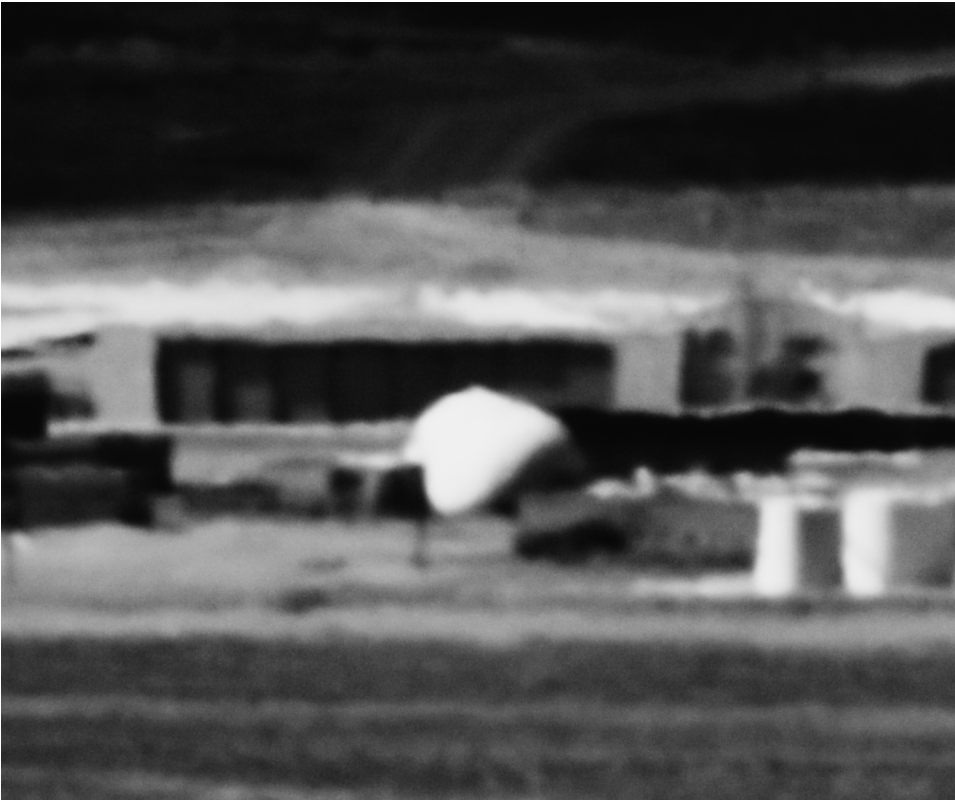
Paglen. Large Hangars and Fuel Storage; Tonopah Test Range, NV Distance ~ 18 miles, 10:44 a.m. 2005.

nized warfare and its transformation of commercial road and air travel, or technologically advanced genocide and the bomb. It could be argued that all established a relation to the technological sublime—an awe in the face of vastly complex systems and their uncontrollable consequences (though in Dada, this was taken parodically). Obviously, the postmodern period often thought of itself as a time of exhaustion and perhaps decadence in which the passive consumption of reproductive technologies (above all, television) appeared to dominate over the romance and fears attached to innovative productive ones. So this is my first question: is your reference back to these older forms a way of saying that we no longer live in such times?