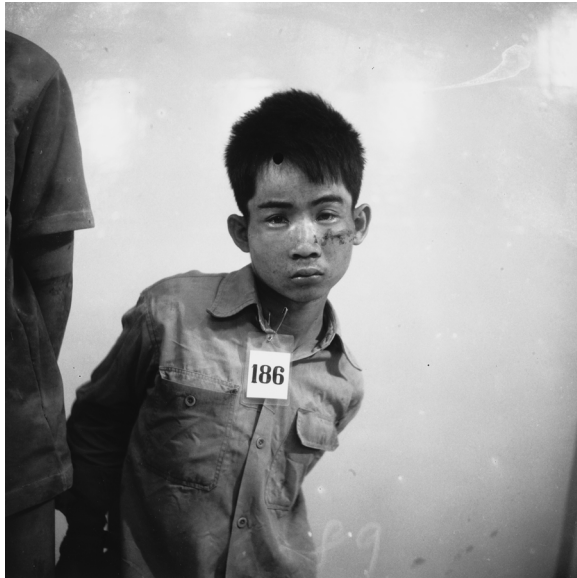
Two prisoners at Cambodia's S-21 prison, circa 1978.