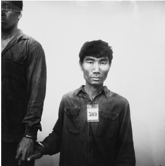
Two prisoners at Cambodia's S-21 prison, circa 1978.