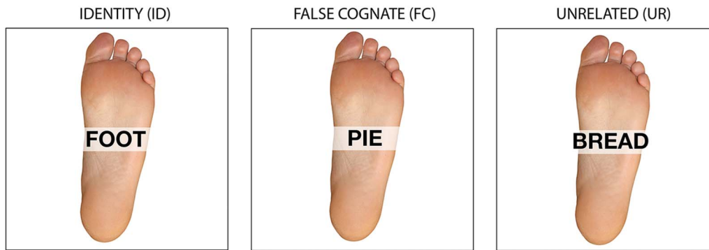
Figure 1. Picture-word matching task example stimuli in the Identity (ID) condition (the picture name and the distractor word match), the False Cognate (FC) condition (the picture name and the distractor word do not match and are false cognates, pie means “foot” in Spanish but not in English), and the Unrelated (UR) condition (the picture name and the distractor word do not match and are unrelated phonologically and semantically). In the FC condition, while participants might be tempted to respond that the picture and overlaid word are matches since the English word PIE is a perfect homograph with the Spanish translation equivalent of foot , this response would be incorrect.