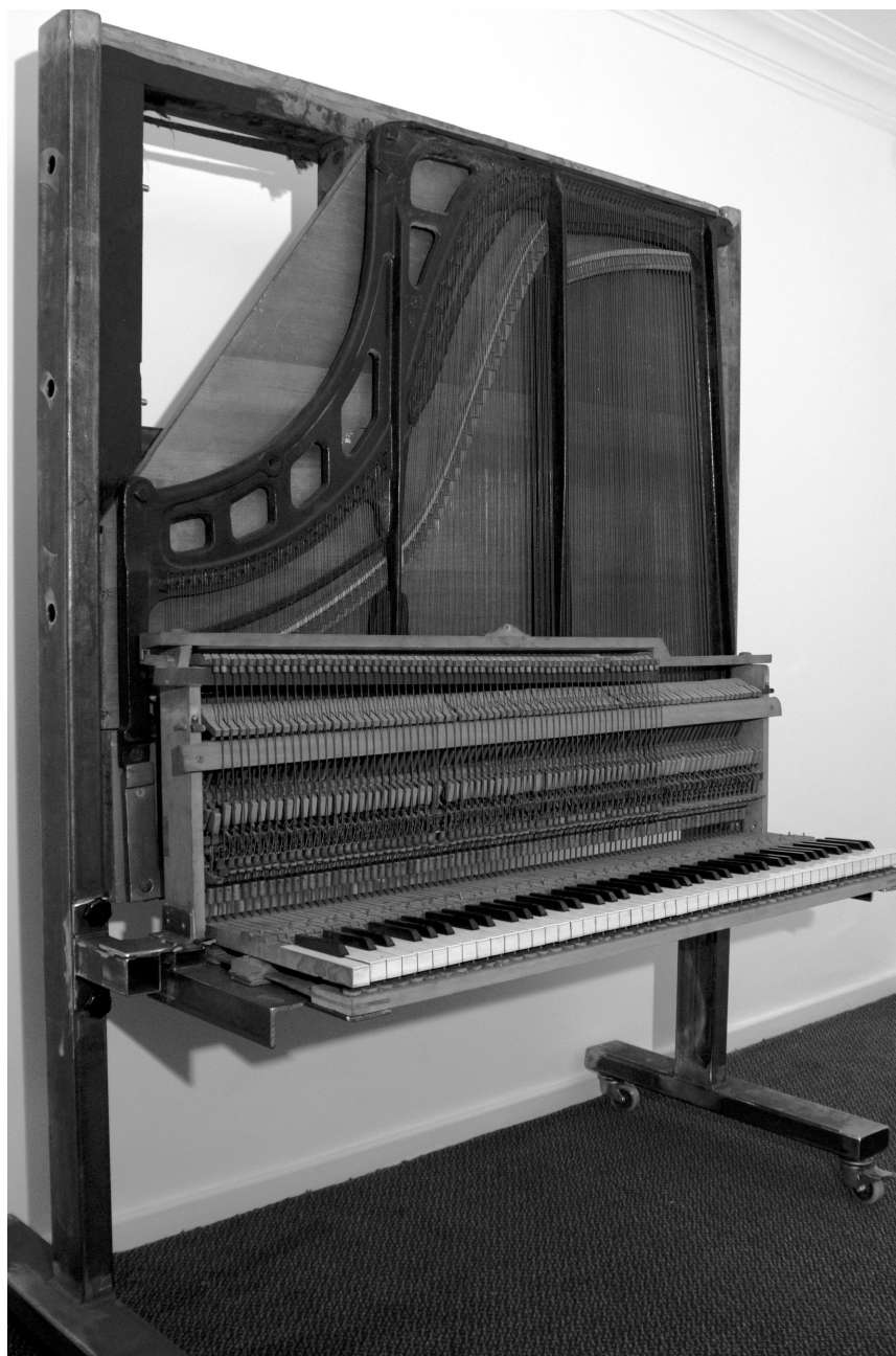
Fig. 6. First prototype of Nicolls's piano.

This question of where complexity resides is also a powerful design point: If one desires the gross result to be balanced, then cases where more complexity occurs at the interface level should be balanced by less complexity in the detailed physical control: that is, some-