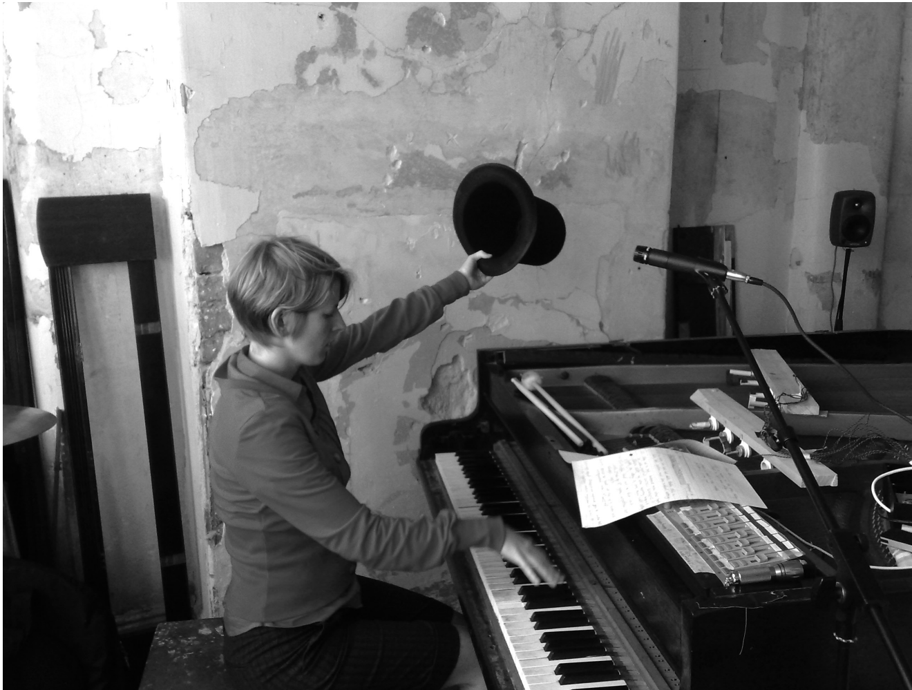
Fig. 4. Practicing for the collaboration with Centre for Digital Music.

constantly shifted my attention, and the process thus felt akin to performing with other live musicians. Indeed, the resulting piece I found to be such a detailed web of interactivity, with many subtle changes of technological response, that it felt very much as if I were improvising with Tremblay himself: The “performance environment” engaged me in a living, breathing way. What fascinates me is how strict yet supple the piece is, and I conclude that using improvisation as a methodology enabled this commonality to thrive.