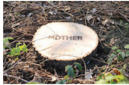
Fig. 1. The Listening Wood , Hampstead Heath (© Preamble, 2019. Photo: Leah Lovett.)

of their age [2]. Crown retrenchment, decay and exposed dead wood betray the survival of the oldest of the project trees—a 450-year-old oak—through two "Great Storms" (1703, 1987) and industrial urbanization. Hollowed, gnarled and fallen veteran trees provide microhabitats to support the biodiversity of urban parks like Hampstead Heath, but they also offer a point of contact with the past, across sweeps of time spanning human generations. Almost two centuries before its inclusion in The Listening Wood project, the leaning pine of Sandy Heath (Fig. 2) was sketched by the landscape painter John Constable [3]; nearby, a pair of three-century-old oaks stand precariously atop a mound of sand, undermined for railway infrastructure projects by Victorian industrialists [4].