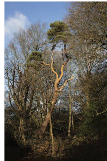
Fig. 2. The leaning pine, Sandy Heath.

Digital communications technologies have also served to mediate and shape scientific knowledge of arboreal societies in recent years, as the coining of the term "wood wide web" to describe the mycorrhizal network of hyphae through which trees transmit information about their environment and share resources might imply [6]. Research instigated by ecologist Simard in the 1990s has contributed to an emergent understanding of trees as social and essentially collaborative: Saplings without access to the canopy may receive vital resources from "mother" trees, which in turn become established as "nodes" in the network [7].