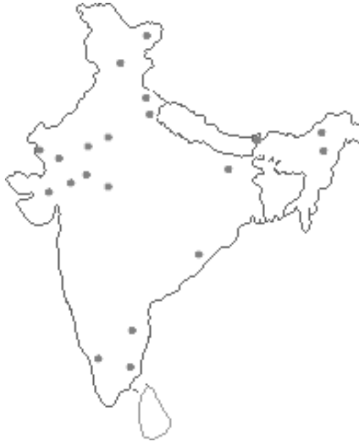
Figure 1. Locations of Trained Women Barefoot Solar Engineers in India.

have prevented several hundred thousand liters of diesel and kerosene from being burned. They have preserved forests and even controlled environmental pollution to some extent. As a result, since 1989, they have kept 1.2 million tons of carbon emissions from entering the atmosphere (See Table 2).