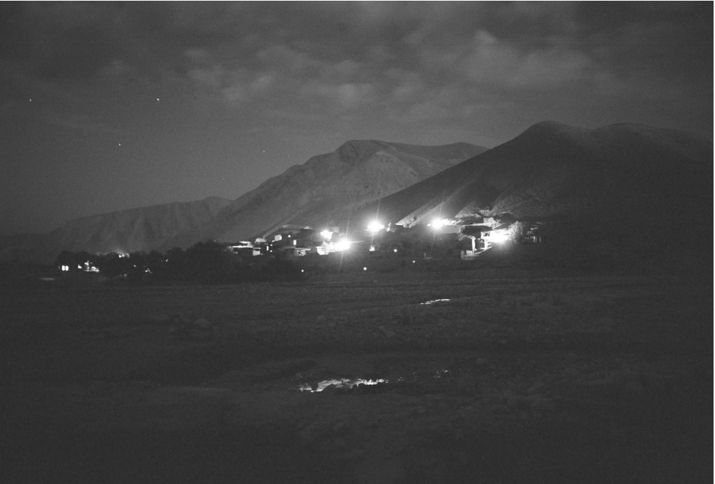
Solar electrified village at night.