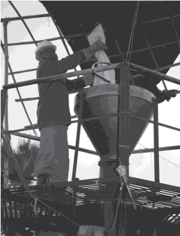
Plant Operator in Action

using fossil fuels, which provides an additional source of revenue, as much as 10 percent of the total. The firm is also expanding its sales model by partnering with electrical appliance and consumer goods manufacturers to channel quality products directly to rural customers in a cost-effective manner.