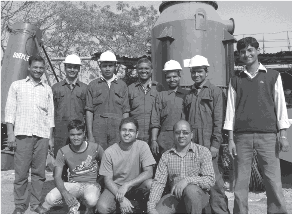
Installed Power Plant and HPS Team