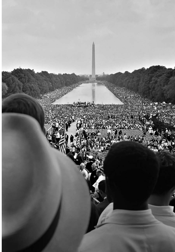
Figure 2. Crowds surrounding the Reflecting Pool, during the 1963 March on Washington, DC.