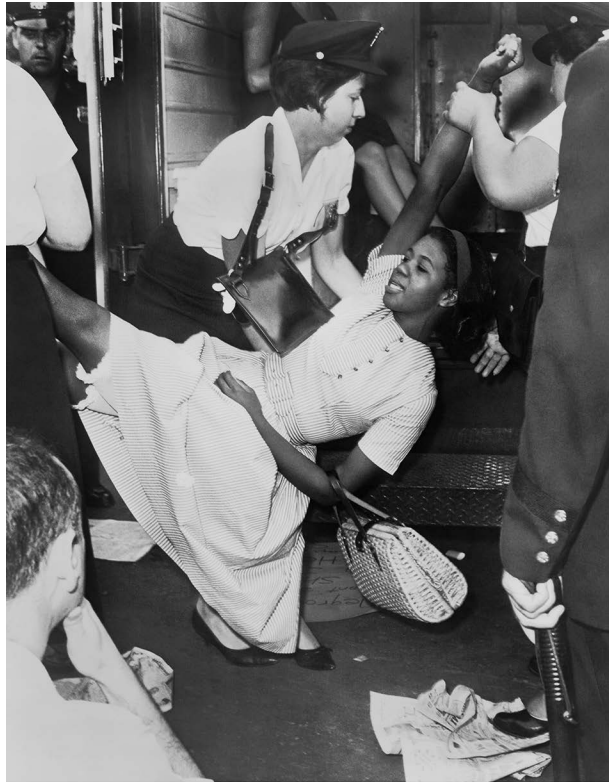
Figure 6. An African American woman being carried to a police patrol wagon during a demonstration in Brooklyn, NY, 1963.

As Northern whites witnessed these unfolding acts of the civil rights drama in what, thanks to television news, seemed like real time, their sentimental sympathy for the “lost cause” of Southern whites gradually evaporated. “We have never [...] scattered our efforts,” King confided to a journalist in 1964, “but have focused upon specific symbolic objectives” (in Garrow 1978:321). Symbolic power, King understood, has real effects. Cathecting with the black protagonists, not their Southern white opponents, Northern citizen-audiences demanded that federal power be deployed to protect powerless blacks and punish their white oppressors. In 1964 and 1965, Congress, acting in the aftermath of JFK’s assassination, abolished segregation laws, and passed legislation insuring black civil and political rights. Northern state power invaded the states of the old Confederacy. Many called it the second Reconstruction.