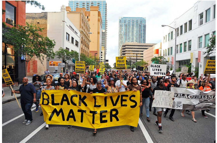
Figure 7. The Black Lives Matter movement march on Tampa Street in downtown Tampa, FL, back to Lykes Gaslight Park, 11 July 2016.

The demonstrators outside the Cleveland arena welcomed these gestures, seeing their potential for connecting with a much wider audience beyond.