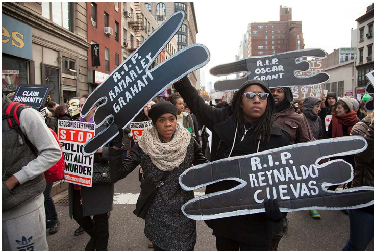
Figure 8. Sparked by the Grand Jury verdicts in Ferguson, MO, and the Eric Garner murder in Staten Island, NY, thousands marched on 13 December 2014 in New York City against police racial bias and the killings of unarmed black men all over the USA.

to the sacred tradition of black civil rights, providing one of the organization’s founders a platform to declaim about repression, resilience, and destiny: