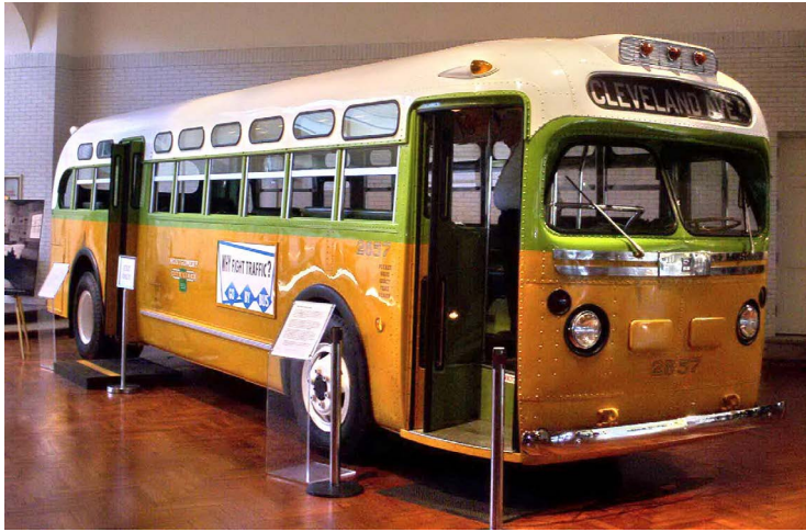
Figure 5. The bus on which Rosa Parks refused to give up her seat sparking the Montgomery bus boycott, on exhibit at the Henry Ford Museum in Dearborn, Michigan.

the emergence of such persuasive African American performers as Douglass, Tubman, and Du Bois, and such publicizing organizations as the NAACP (the National Association for the Advancement of Colored People), did the potential for such mutual identification develop.