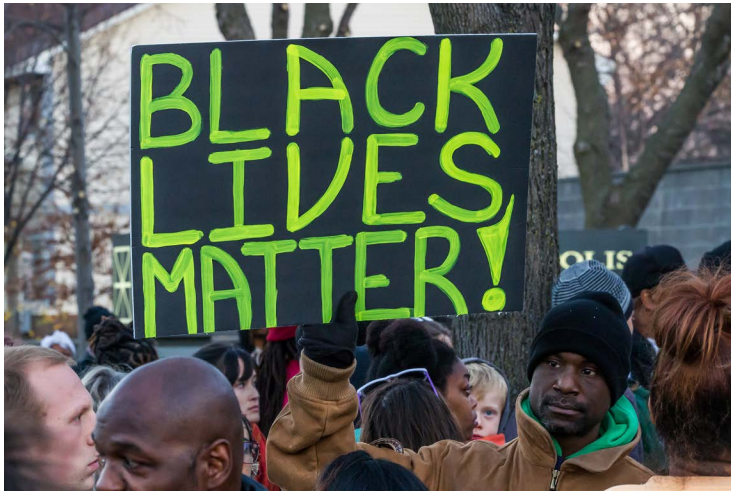
Figure 10. An activist holds a “Black Lives Matter” sign outside the Minneapolis police fourth precinct building during the Black Lives Matter occupation following the officer-involved shooting of Jamar Clark. Minneapolis, Minnesota, 15 November 2015.

This two-part performative structure remained in place even as the protest movement’s organization and tactics changed. Later in 2015, the controversies concerning police killings seemed to abate. 11 “If the goal of Black Lives Matter was [...] to convince more Americans that police brutality existed,” the New York Times reported, then “it was successful.” With that success, the Times observed, “the momentum began to shift and transform into something else,” and “there were fewer protests than before” (Howard 2016). BLM’s national organization broke into more than 30 rela-