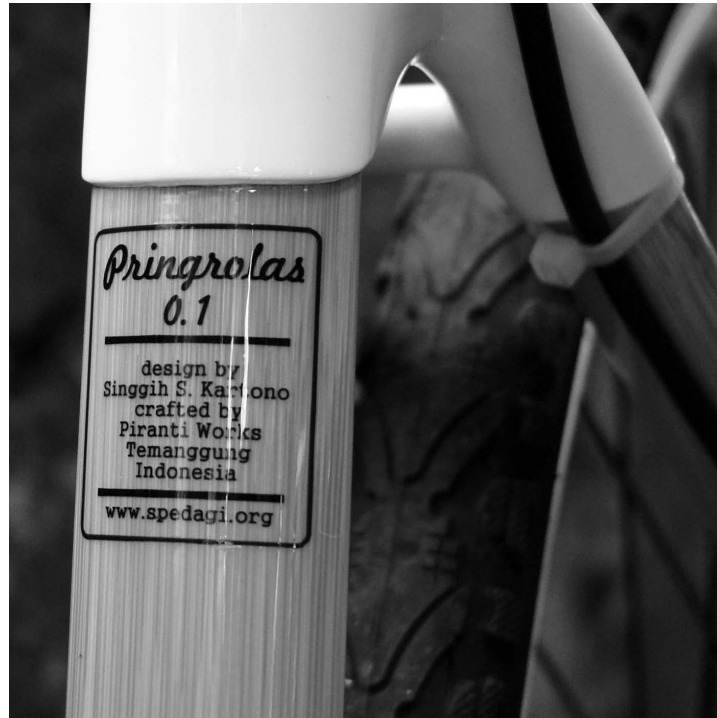
Figure 2 Pringrolas 0.1.

The use of local bamboo to make bicycles in Kandangan is an example of an everyday designed object that intensifies the meaning and affect of a material (bamboo) and also performs that meaning in the public realm. Spedagi released a full range of bicycles for sale in 2017. Bicycles are hand-numbered by each limited edition, and designs are revised iteratively and improved quickly with each small-run edition production. As evidenced by the marketing of the bicycle, the project asks us to reimagine the village by connecting to global design culture. The website states that the “Spedagi Bamboo Bike is ‘magnet’ and icon, as well as the metaphor, of Village Revitalization itself: It was born from something that has been forgotten.” 25