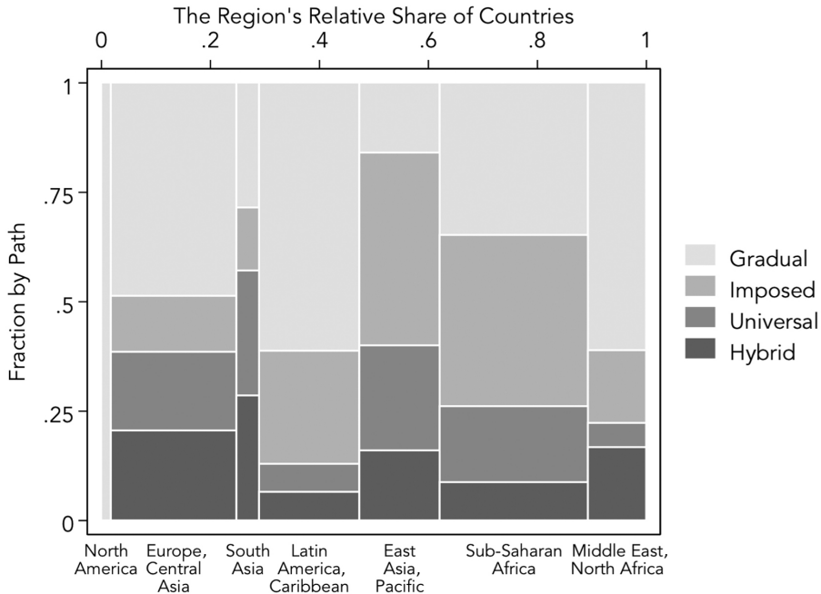
Figure 2 Paths to Women's Equal Suffrage by Region

Note: The x-axis shows the fraction of all the world's countries that are in each region. The y-axis shows the fraction of countries in each region that followed each path toward enfranchisement.