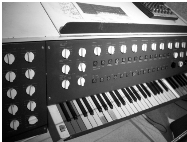
Figure 2. The Subharchord (1964), Gerhard Steinke used in the Bratislava Studio, now located in Vienna. For further details, see the articles by Ernst Schreiber (1964), Gerhard Steinke (1966), Tatjana Böhme-Mehner (2011), and the overview available at www.adk.de/en/academy/studio-for-electroacoustic-music/subharchord.htm .

to develop a new musical instrument called the Subharchord, which generated sounds electronically (see Figure 2). This instrument was actually built, and it formed the center of a working studio. That was a laboratory for research and development.