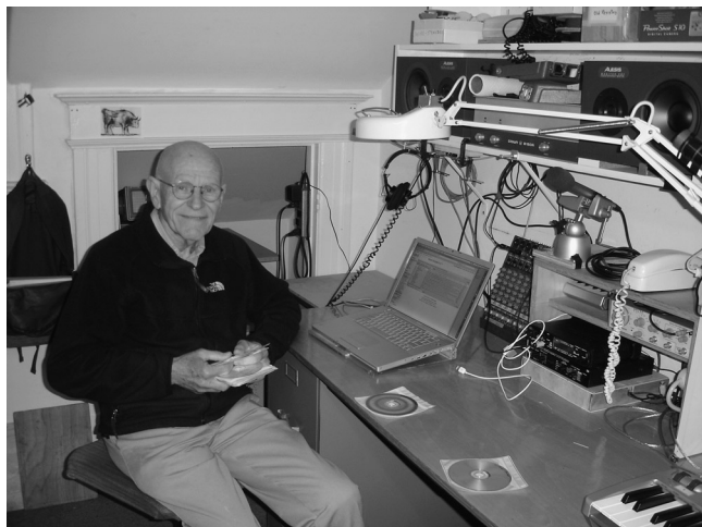
Figure 1. Max Mathews at his home in San Francisco in late May 2008.

avored, since my family still lived in Nebraska—I went to Bell Telephone Laboratories (Figure 2), where I went into the Audio Research Department to study new and better ways of compressing and encoding speech so it could be transmitted over the very limited-channel-capacity wires and radio that were available in those days.