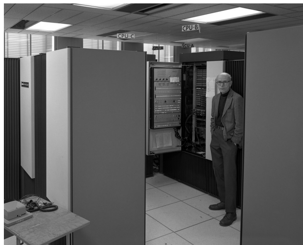
Figure 2. Max Mathews and an IBM mainframe at Bell Laboratories.

computer-digitized tapes into sound, I could write a program to perform music on the computer.