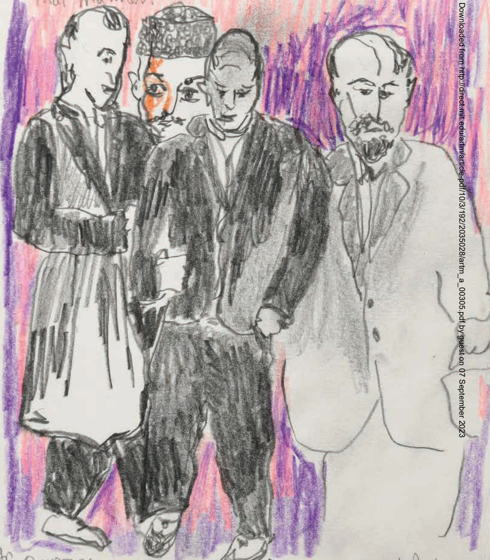
Foreign ministers CURZON Britain

The Mapping of Modern Turkey in 1923, ends in 2023 Lausanne. THE FALL OF OTTOMAN TURKEY AFTER WWI IN 2017 Erdogan broadcasted that Turkey's frontiers should extend beyond. THE conflict with Greece continues until now on Aegean Sea & Islands + EEZ on islands. Turkey was given Amnesty over its war crimes, & Genocides of Greeks, Armenians, Assyrians. - Belsten, 1914/ 1922 THIS opened doors for other nations to behave in that manner.