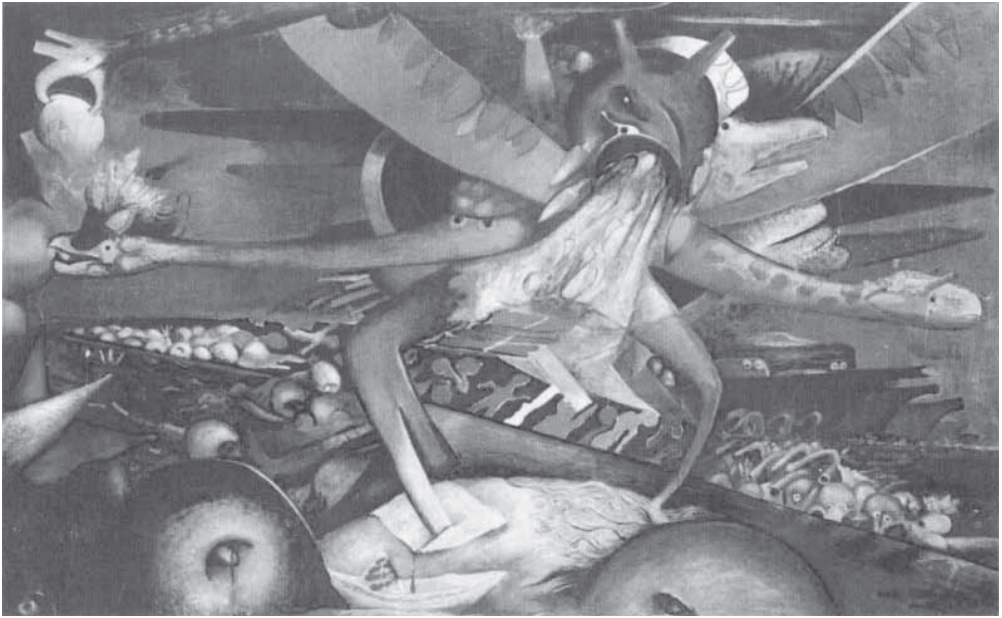
Roberto Álvarez Ríos, Human Beings, Wars, Invasions, etc. Enough! . Oil on canvas, 200 x 127 cm. 1965. Artist's collection.

just months earlier, in June of 1977, on the occasion of an exhibition of his lithographs in the Museo Nacional de Bellas Artes in Havana, some of which were created to accompany the latter's poem "El último viaje del buque fantasma" (1976). 26 A few poems from Césaire and an essay from Carpentier, together with Althusser's, would see the light of day following Lam's death in 1982, when they were included in a catalog accompanying three exhibitions in Madrid, Paris, and Brussels to commemorate and celebrate Lam's work. 27 In his earlier essay on Álvarez Ríos, Althusser had explicitly referenced Lam. "In 1950," he writes, "still in Havana, [Álvarez Ríos] meets Lam , whose exhibition deeply affects him." 28 The word " Lam " is italicized, as if emphasizing Álvarez Ríos's formative experience and Lam's towering presence in Cuban art.