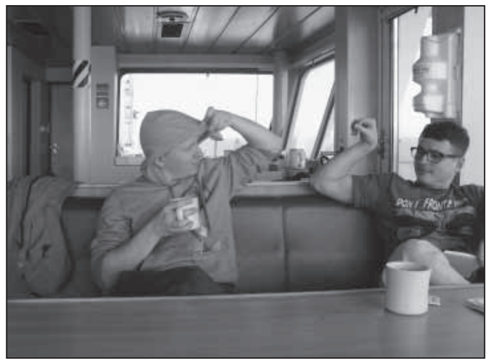
FIGHT THE POWER

R: Are you afraid of blacks? H: No, but I'm afraid of people. R: Do you wish Poland was a multiethnic society? H: Yes, mainly because of the food. The art of cooking is the foundation of every community, and when you have a culinary monoculture, the people become aggressive. R: Do you think that mixing cultures this way has any pluses? H: A more colorful culture does not mean a more interesting one. Metaphorically speaking, if you have lots of colored pencils, you use each of them a little. But if you have a pencil, you get lost if you use it in lots of different ways. So maybe it's the same with communities. From within, they're