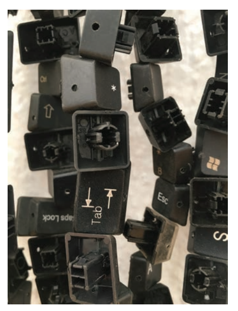
10a-b Moffat Takadiwa The Urinari/Chinjausi (2017) Found computer keys and medical bottle tops; 700 cm x 500 cm 10a 10b (detail, right)

variety of centers within Africa that reverberate with historical significance they can form strong linkages to. They do not have to leave the continent to be validated.