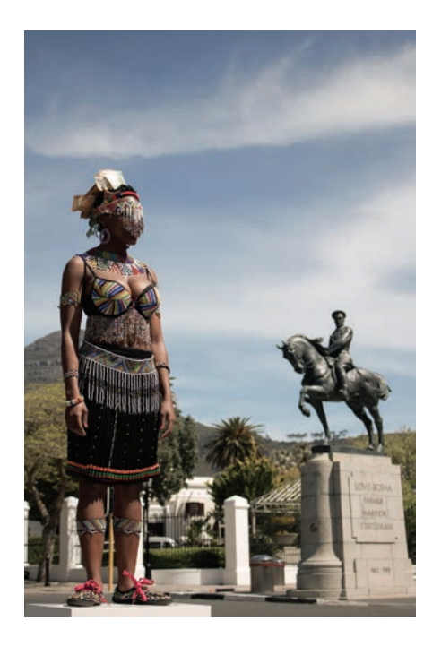
4-7 Sethembile Msezane, Performances from the Public Holiday series. Clockwise from top left: Untitled (Heritage Day), 2013; Untitled (Youth Day), 2014; Untitled (Worker's Day), 2014; Untitled (Day of Reconciliation), 2014.