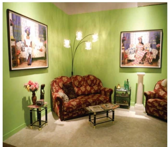
6 Zina Saro-Wiwa and Mickalene Thomas Parlour (2010) Installation view

Adesokan asserts that “the market is the bedrock of livelihood: it is a complex site of resistance, where the collective unconscious is shaped through traditional schemes of globalization” (2011:6). It is a space of exchange, of spectacle, and can be regarded as a profound space. People sell what they produce but the marketplace is also a place where cultural performances such as Alarinjo, from which Nollywood is derived, 10 and other travelling theater troupes would perform. Considering Adesokan’s definition of the market as “both system and place” that bears the “distinction between peripheral/primitive economies and Western economies” (2011:6), the marketplace can be argued to be a fantastic space par excellence . In Marxist theory, the materialist notion of fetishism, in which relations between people are defined through the exchange of commodities, may illuminate dyadic interpretations of the money fantasy as magic or wealth. There is the notion of the marketplace as an actual market, a place. However, there is also an abstract concept of the marketplace as space for the mystified and unconstrained exchange and flow of global capitalist trading that is cynically termed “zombie capitalism.” The negotiation of traditional practices in the West African market and international capitalist forces (the presence of mass-produced factory commodities as well as individually or communally produced items) deepens the images of the marketplace in Nollywood video-film.