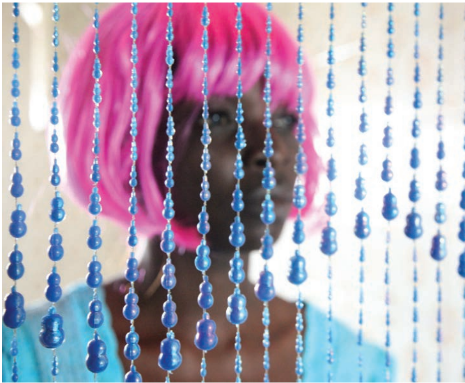
2 Zina Saro-Wiwa Phyllis: I Am Not Alone (2010) Archival print