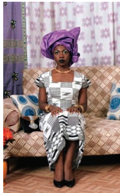
10 Mickalene Thomas Two Wives: Nollywood #2 (2010) C-Print

Profundity seems an inappropriate and impossible term to use next to Nollywood video-film. It seems to be a better fit for the word “art.” Given that the kind of social value that is granted to art is based on concepts of authenticity, originality, and provenance, contemporary cultural practice questions the manufacture of value within the context of unequal economic development. Complicating this dynamic is the dichotomy between high art forms and popular culture. In European critical theory, this dichotomy is characterized by “a confrontation between the rural and urban working people’s tactics, aimed at the production of an autonomous culture (identity), and the institutions’ and elites’ strategies of dampening their old and odd cultural elements” (de Certeau in Jewsiewicki 1996:343). The differentiation between art and popular culture is based on legitimation, where art is regarded as singularly produced and intellectually engaging, but popular culture is perceived as mass-produced easy pleasure. Nollywood is referred to as popular culture (Barber 1982). This term, however, should not mean that it is depoliticized. For Stuart Hall, “popular culture is ... the ground on which transformations are worked” (1998:443). If one con-