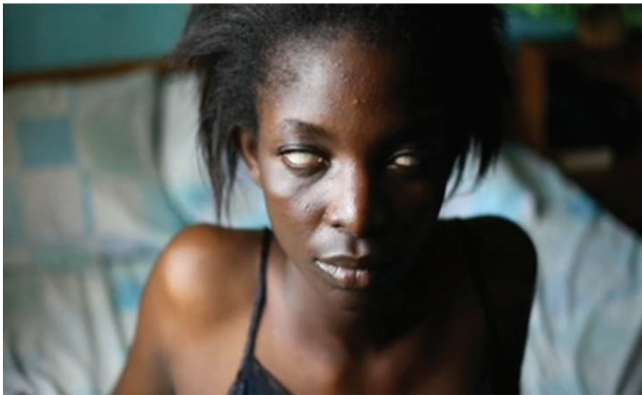
4 Zina Saro-Wiwa Phyllis (2010) Video still

Homeplace for hooks is a site of resistance. Home in Zina Saro-Wiwa's work is not only about estrangement and dislocation but also about resistance to seeing the home as a limitation for subjectivity. Saro-Wiwa defines Phyllis's state of mind as "loneliness" and as a kind of "mental illness." The video can be read as an interpretation of the mental space or space of the mind. This is not only in the use of things placed on the head (the wig, the veil, and the enamel tray) or the whitening of Phyllis's eyes but also in its portrayal of the infinitude of imagination, of place and ways of seeing. Since Phyllis finds it hard to wake up, what is seen in the video could be things imagined or dreams within dreams and therefore the visual realization of home as an abstract space.