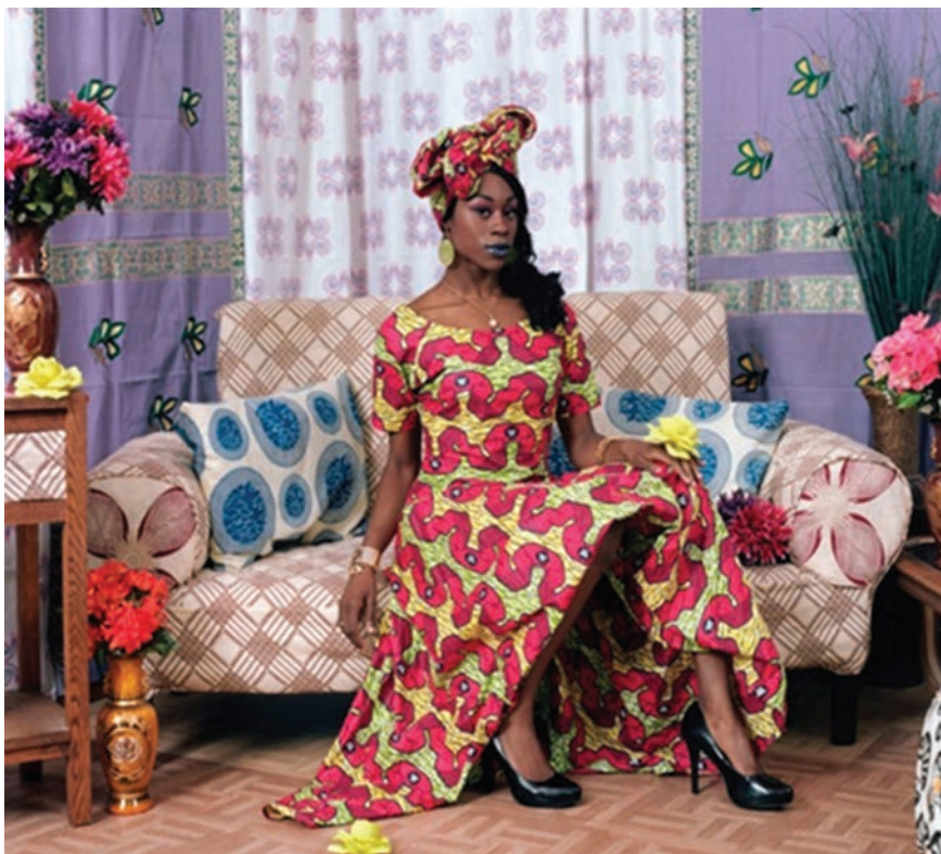
11 Mickalene Thomas Two Wives: Nollywood #1 (2010) C-Print