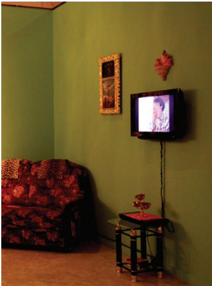
12 Television set Zina Saro-Wiwa's and Mickalene Thomas's installation Parlour (2010)

Stone in Abuja” was an installation of a typical interior of a living room or parlor with green walls in Lagos, fashioned like the parlors that are used as a setting for most Nollywood video-films (Fig. 6). In this installation, there is a “fake” miniature Doric column, “fake” or plastic and glass flowers, “fake” gold-rimmed drinking glasses, and a “fake” gold gilded frame with an image of Christ on the cross, as well as flower-shaped lamp shades (Figs. 7–9). On the walls are large portrait photographs of Nollywood actresses by Mickalene Thomas. The actresses are dressed in batik print fabric outfits and seated on couches that are also covered with batik print fabric (Figs. 10–11). 14