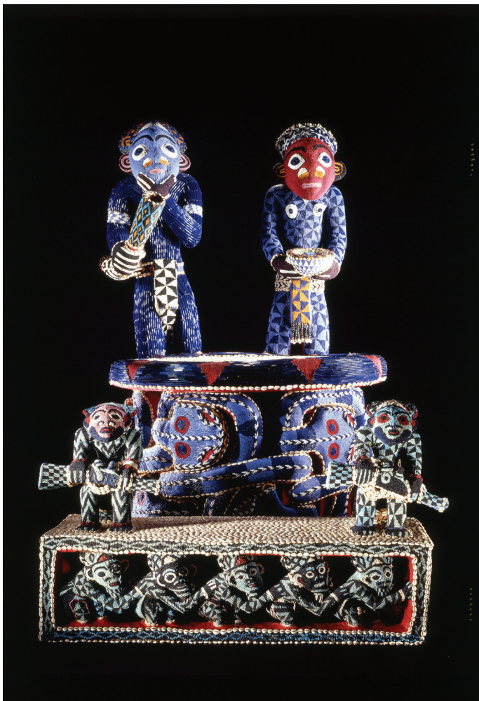
14 Unidentified artists Two-figure throne and footrest ( mandu yenu ), second half of the 19th century Wood, glass beads, cowrie shells, cloth; 174 cm x 126 cm x 155 cm III C 33341 a, b, Ethnologisches Museum, Staatliche Museen zu Berlin

themselves were an intended audience. They chose to ignore the strong probability that the “natives” were managing them, shaping their beliefs about the events and the objects in circulation around them. The artifice of the festivities, for the foreign visitors, lay in reenacting rituals to convince Bamum audiences that the masquerades and dances (and the objects associated with them) were powerless and ineffective, not in making the foreigners believe that the rituals and objects were “real.”