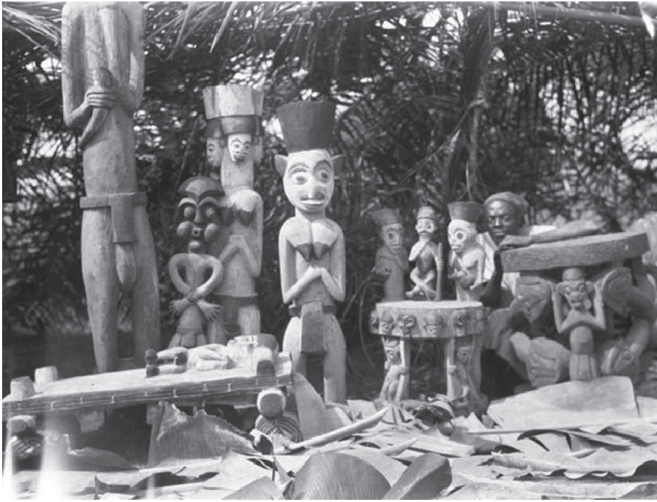
3 Man Posing with Carved Wooden Idols (1929)