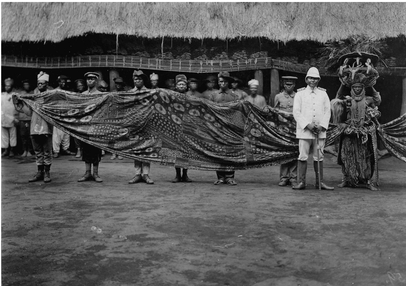
15 Bernhard Ankermann Tanzkleid des Königs, rechte Hälfte (1908) Black and white positive VIII A 5331, Staatliche Museen zu Berlin– Ethnologisches Museum

Indeed, today the artisanat of Foumban is known not only for making contemporary objects that resemble older Bamum works of art but for its astonishing range of objects that appear like art from other parts of Africa. Cast brass heads in the style of works from the Benin kingdom, masks that resemble works from Igboland, figures covered with nails, like those from Congo, and new inventions, such as huge brass figures called “Tikar” are all made in workshops in and around the Bamum capital. Such production, one may contend, represents a logical extension