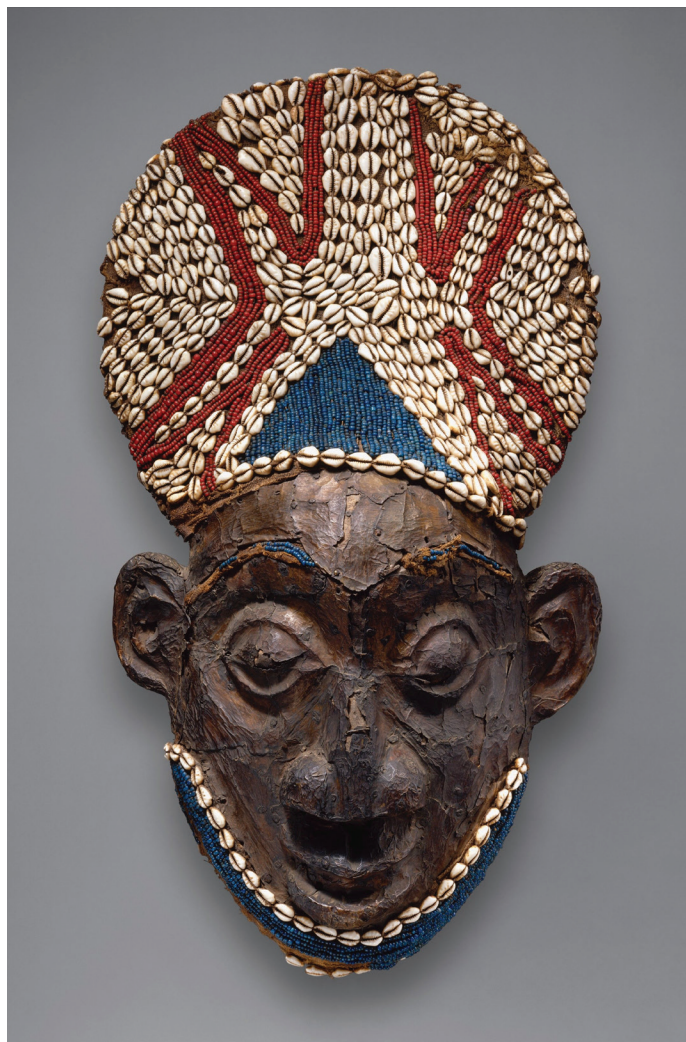
10 Unidentified artists Helmet mask, 19th or 20th century Wood, copper, glass beads, raffia, cowrie shells; 66 cm x 35.6 cm x 27.3 cm Metropolitan Museum of Art 1978.412.560 The Michael C. Rockefeller Memorial Collection, Purchase, Nelson A. Rockefeller Gift, 1967

But such first appearances are also deceptive. The seat differs in a number of crucial ways from royal two-figure thrones in the Bamum kingdom. For one, there is no indication it was meant to be beaded, and the cylinder of the seat is composed of alternating rows of carved human heads rather than interlocking double-headed serpents. The form and iconography of the seat and footrest are a simultaneous avowal and disavowal of its similarity to the two-figure thrones that are symbols of Bamum monarchy. The appearance of the people surrounding the throne is also a fantasy. The costumes mix what appear to be older elements with newer styles—the seated man is wearing trousers under his loincloth and his headdress is only an approximation of the king’s dancing costume headdress (Fig. 15). The men immediately flanking the seated figure are wearing modern robes in a style that had become popular since the German colonial period, and it would have been unthinkable for women from the royal family, queens or princesses, to allow themselves to be photographed bare-chested, especially after King Njoya had converted to Islam. The photographs of members of the Bamum royal family, of