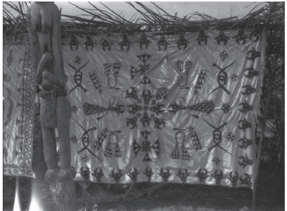
4 Advertisement for the artisanat of Fomban, Journal officiel des territoires occupés de l'ancien Cameroun , April 1927 (236):227.

Just as crucially, during the 1920s the French administration that replaced the German colonial authorities sidelined King Njoya, reducing his power, authority, and resources and suppressing much of the visual culture of the Bamum monarchy.