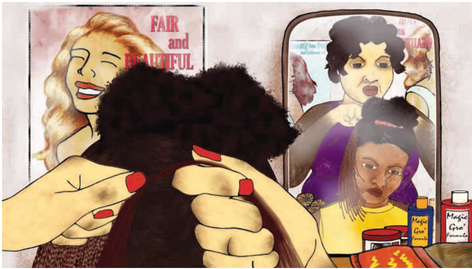
3 A still image from the opening sequence to Ng'endo Mukii's Yellow Fever (2012) as the artist gives an account of her memory of the mkorogo woman braiding her hair.

In 2014, for example, the Lagos Photo Photography Festival in Nigeria alluded to the strategies of contemporary artists who sought to expand beyond with the dichotomy of fiction and documentary by theming the event under the title, “Staging Reality, Documenting Fiction.”