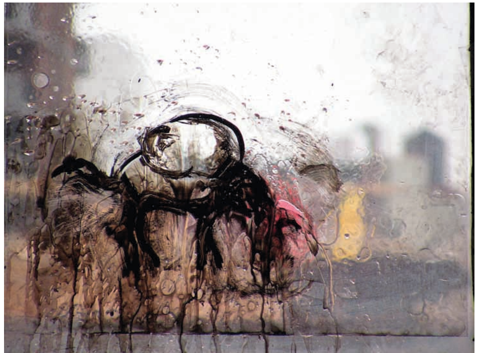
12 A single digital photograph, one of a sequence, in Ezra Wube's Indamora (2009) of the ink Amharic word metamorphosing into silhouetted nomadic figures.

Wube's work demonstrates versatility in dissemination and contexts of viewership that echo the oscillation that Buchan (2012) identifies within animation and its position in the high/low art divide. Furthermore, its straddling of different aesthetic forms and materials encourage their inclusion within and across different contexts and genres. In November 2013, Wube was commissioned to create an animated piece for the Times Square public art project Midnight Moment . This project involved utilizing electronic billboards and signs in a synchronized manner to screen and display different artists' creative content. Wube's At the Same Moment (2013) consisted of animated paintings that illustrated Wube's