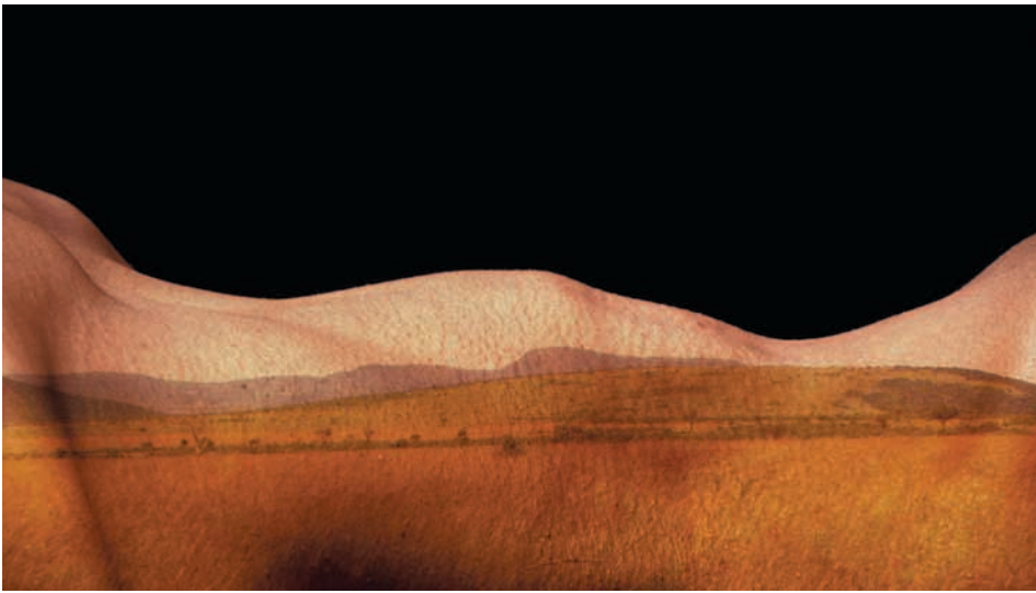
5 A still image from Ng'endo Mukii's Yellow Fever (2012) showing the projection of photographs of a Kenyan landscape upon the female performer.