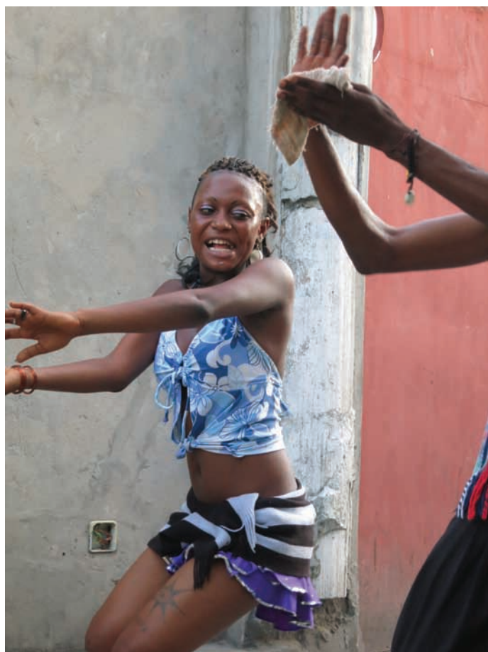
6 Danseuse learning new dance sequence from the band choreographer.

The three main genres of music in Kinshasa are “modern,” “traditional,” and “religious” (White 2008:31). To be sure, like dance, there is aesthetic mixing in the music itself (religious music in form is virtually identical to profane music). However, what moves music into one category or another is the lyrics.