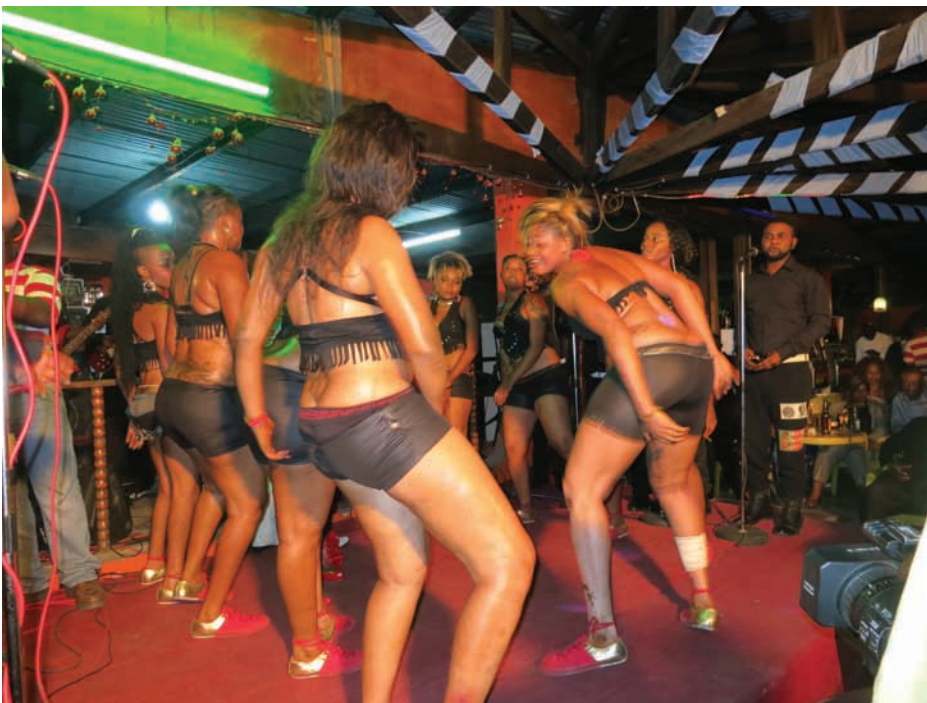
2 A typical concert in which males and female performers are separated on stage.

The state of the music industry in Congo is such that, due to a lack of piracy laws as well as an audience with limited purchasing power, musicians do not profit from music sales in the form of cassettes or CDs. As such, a popular band’s economic success hinges on their live performances. Since stage shows are a crucial element of a band’s longevity, much attention and effort is paid