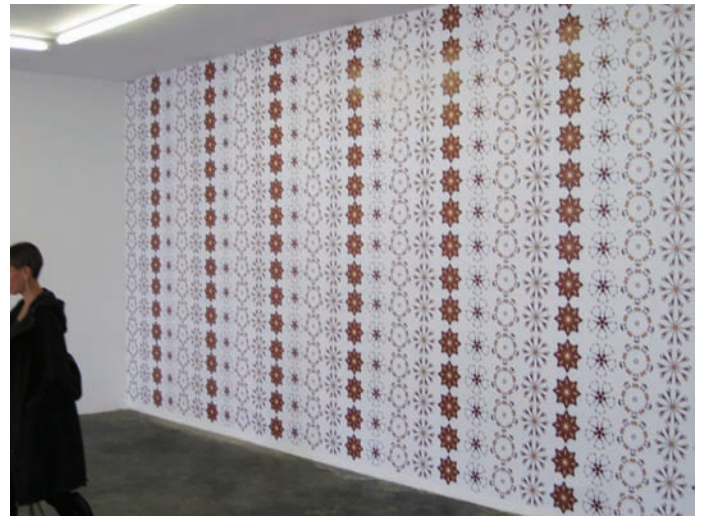
13 Zanele Muholi Isilumo siyaluma (2006–2011) Wallpaper Installation view, Blank Projects, Cape Town 2011

I believe Muholi's insistence on developing relationships humanizes the photographic encounter. Because her visual selection is informed by personal contact, she is able to tell people's stories in an intimate way.