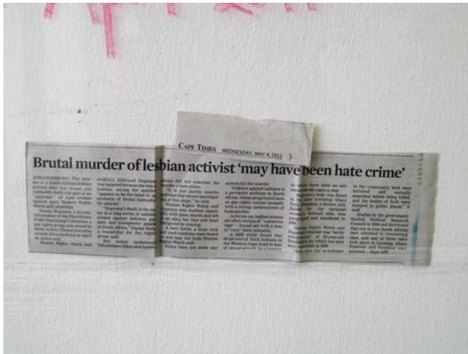
12 Zanele Muholi Isilumo siyaluma (2006–2011) Installation detail, Blank Projects, Cape Town 2011