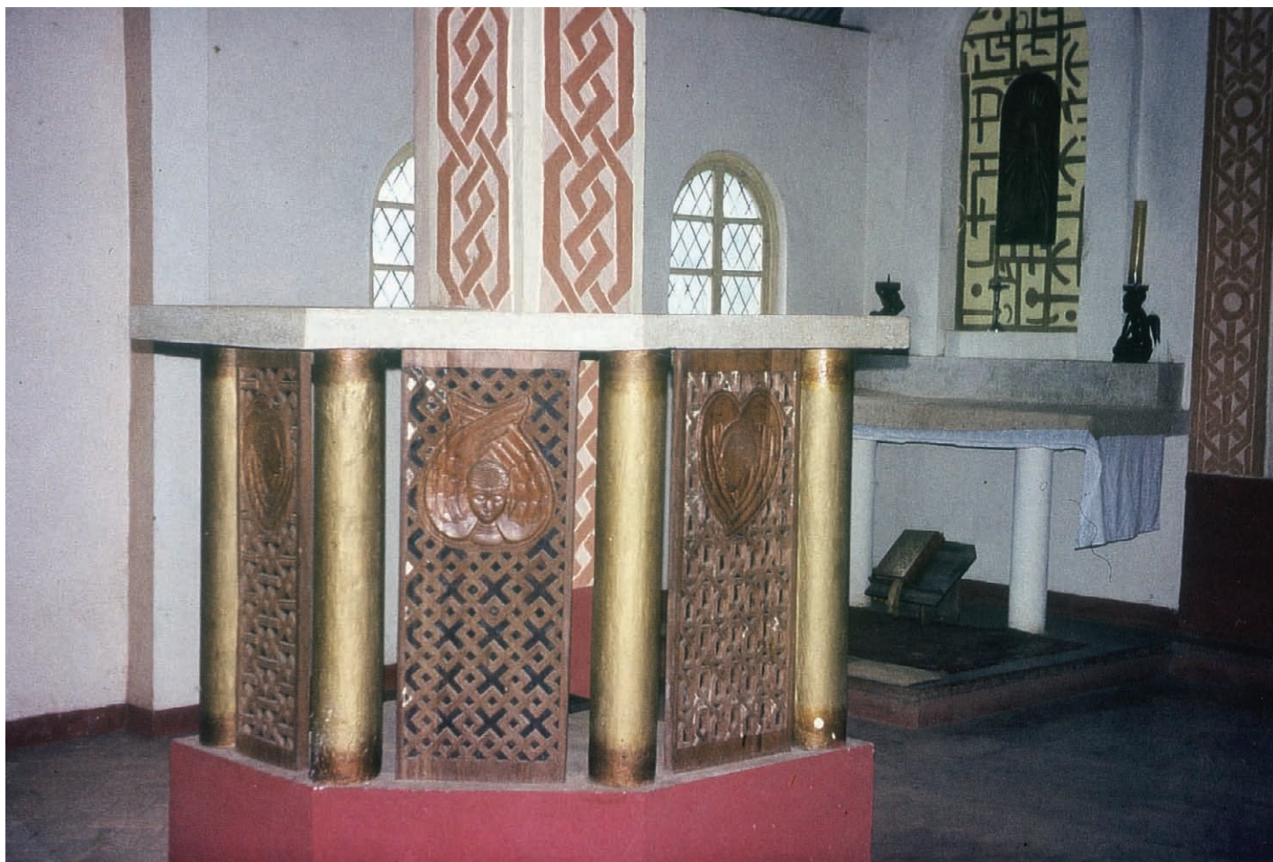
19 The pulpit of the Catholic Church at Nsheng.

kings slept with the figures to absorb the previous king's ngesh or bush spirit. They become a sign of non-Christian beliefs—or perhaps Christian beliefs of demons—blocking the country's move to modernity. The changes in production and meaning of the ndop throughout the twentieth century produce both loss