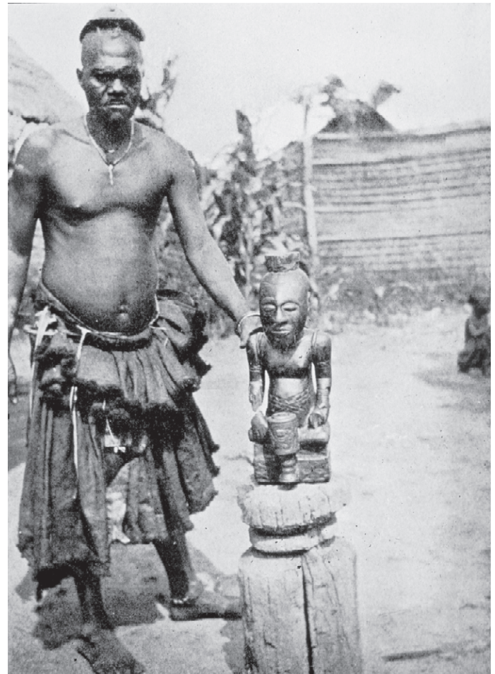
1 Contemporary ndop representing Shyaam aMbulo aNgoong carved by Musunda-Kananga, a Sala Mpasu carver. Democratic Republic of the Congo; 1989. Wood; 35 cm. Collection of the author.

Whether it be the ndop produced in a fine art school representing Kuba pride and heritage, the ndop displayed in major