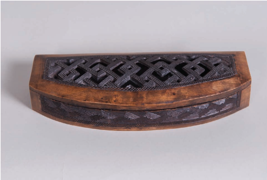
16 Art school box with sharp design and edges.