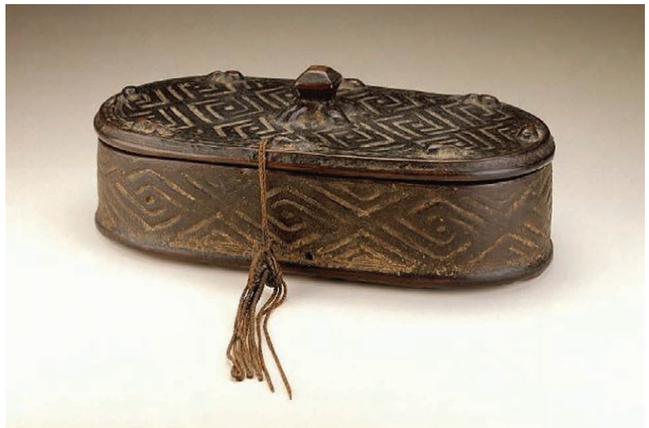
17 Box Kuba peoples, Democratic Republic of Congo, Early- mid 20th century Wood, camwood powder, plant fiber; 7 cm x 32.4 cm x 15.2 cm Bequest of Eliot Elisofon. 73-7-427.

Cyprien, the only Josephite priest still actively teaching, left the school and a director appointed by the government took over.