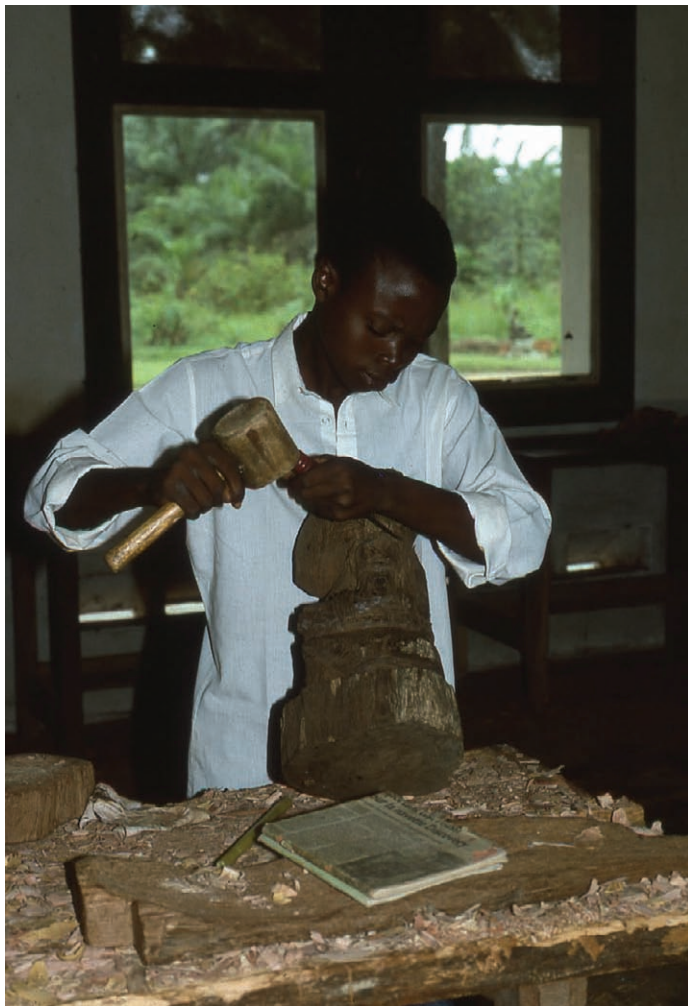
18 Student carving ndop in art school workshop. PHOTO: ELISABETH L. CAMERON, 1989