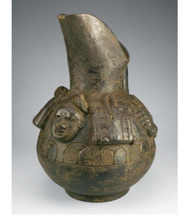
2 Pitcher for palm wine (Mba Molu), late 20th century Martin Fombah, (born c. 1950), Nsei, Cameroon Blackened terracotta, 30.5cm x 20.3cm (12" x 8") Gift of Keith Achepohl, 2004.742.

Martin Fombah's work caters to the new elite in Nsei, who reinforce their status with displays of wealth including pottery. Like much of Fombah's work, this pitcher brings new sculptural emphasis to traditional symbols of power and authority. Here a man's head, crowned with the two-lobed prestige hat of Grassfields' chiefs and title-holders, sits squarely at front. To the left is a bag with a looped handle used to hold sacred objects by members of the palace regulatory society. Below are stylized renderings of the double gong, an instrument strongly associated with chieftancy and court ritual.