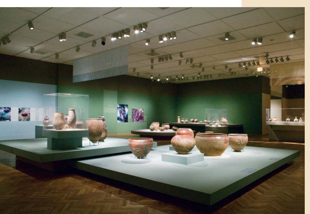
1 An installation view of "For Hearth and Altar: African Ceramics from the Keith Achepohl Collection," Dec. 3, 2005–Feb. 26, 2006. Storage containers from Burkina Faso are featured on the large platform in the foreground.

reflections on our experiences researching and writing about African ceramic arts and we signal some of the limitations of the field's current state of knowledge in an effort to spark interest in future research.